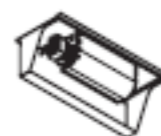
A-2070 Forced ventilation system